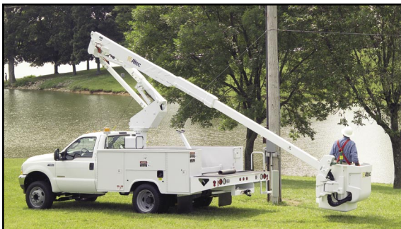
Easy Access From Ground

Altec Aerial Devices meet or exceed all applicable ANSI Standards as of the date of manufacture. Altec reserves the right to improve models and change specifications without notice or obligation.