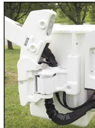
Boom Tip Covers

sales@altec.com Sales – 800-958-2555 Service – 877-GOALTEC